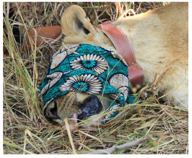
Figs. 1 and 2 – Our Luangwa Valley field team properly fits a collar on an immobilized female lion as part of our long-term carnivore conservation work. The Luangwa is the country's longest—and one of the region's longest—such programmes.