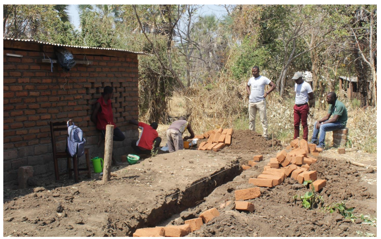
Fig 6. ZCP's Human-Carnivore Conflict Mitigation team assists with the building of a predator proof enclosure aimed at mitigating carnivore conflict with livestock. Together with DNPW, CSL and CWET this project is the first of its kind in Zambia.